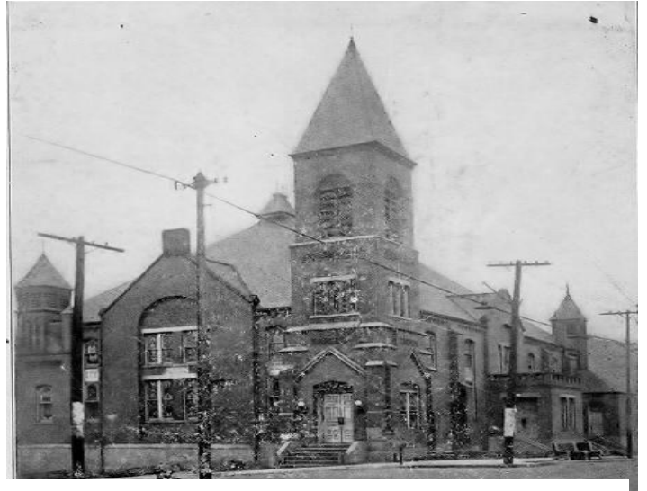
10 th & Charlotte KCMO Location

special occasions among them was Paul Laurance Dunbar, the leading Negro poet of that time as well as Booker T. Washington.