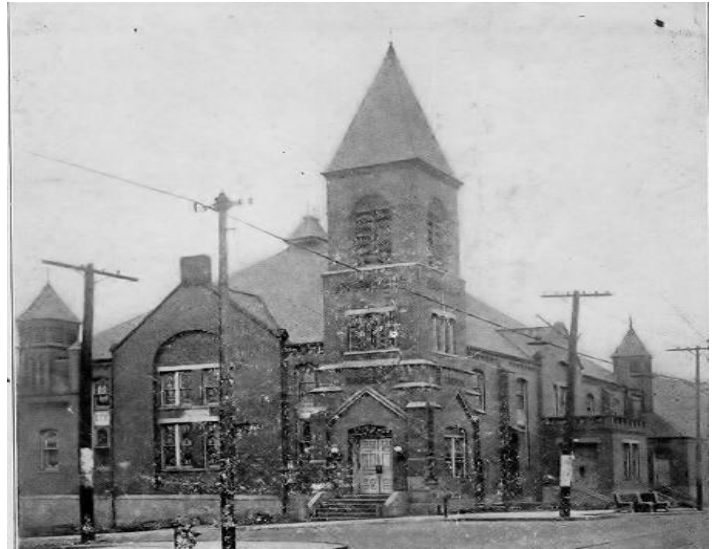
10 th & Charlotte KCMO Location

the leading Negro poet of that time as well as Booker T. Washington.